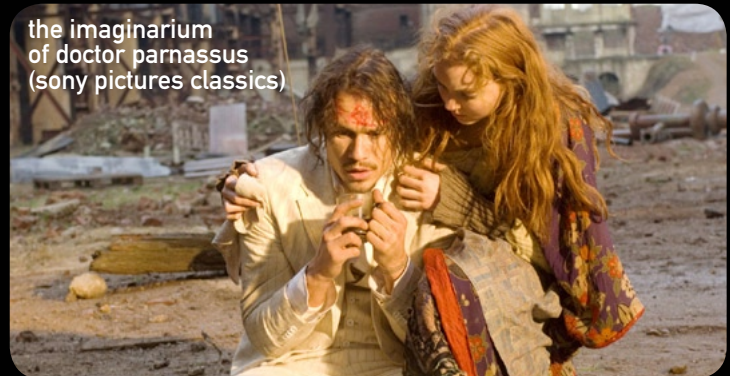
the imaginarium of doctor parnassus